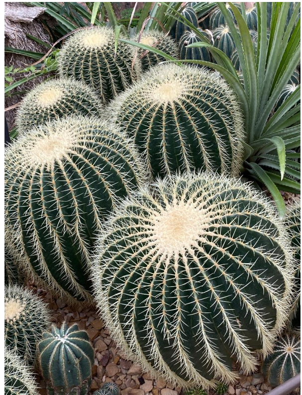
Cacti at Mitchell Park Domes.