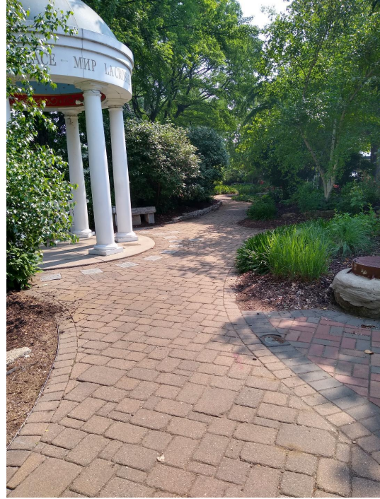
LaCrosse Riverside Park