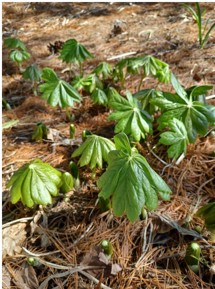
Mayapples. Submitted by Linda Loker.

The new elm tree is a disease resistant variety that will become a valuable part of the city's ecosystem, providing food and shelter for birds and other wildlife as well as a symbol of Neenah's past and future.