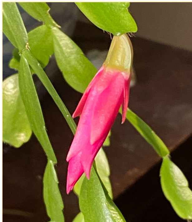
Christmas Cactus bloom